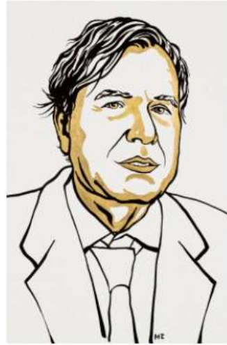
III. Niklas Elmehed © Nobel Prize Outreach Giorgio Parisi