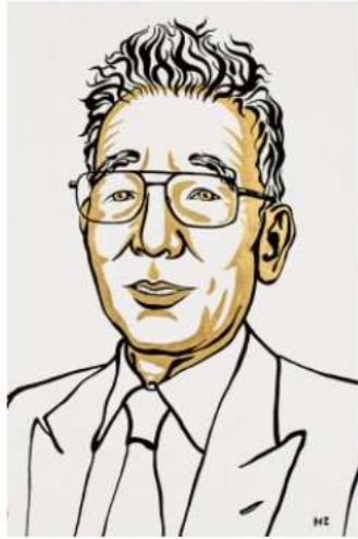
Syukuro Manabe