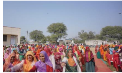
taking a pledge against chemical-based agriculture at Bamanwas Kankar on January 2. By taking decisive steps to secure a sustainable future, Bamanwas Kankar panchayat in Rajasthan has become the first village body in the State to be certified as fully organic.