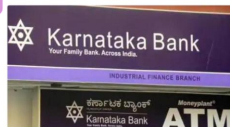
Karnataka Bank emerged as winner in the 'Best Fintech & DPI Adoption' category at the Indian Banks' Association (IBA) Banking Technology Awards.